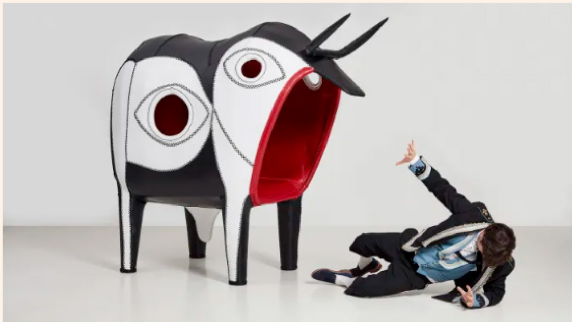
Jaw dropping: the South African designer Porky Hefer's surreal leather bull has a nestlike space for a human to curl up inside its mouth

The Cape Town gallery is exhibiting 16 South African sculptors and designers