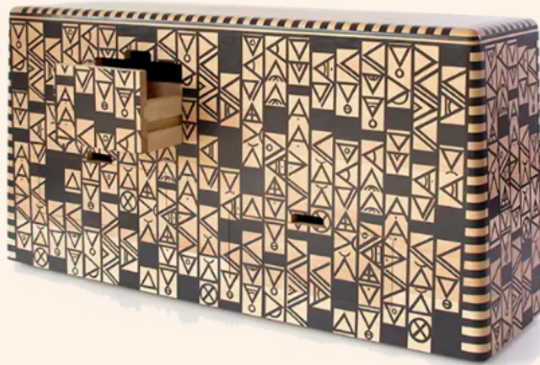
Dokter and Misses' 'Kassena Isibheqe' server